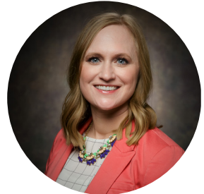
Celia Schnupp Perez & Morris LLC